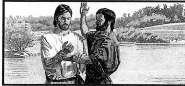
Then cometh Jesus from Galilee to Jordan unto John, to be baptized of him. Matt 3:13

But Jesus said, Suffer little children, and forbid them not, to come unto me: for of such is the kingdom of heaven. Matt 19:14