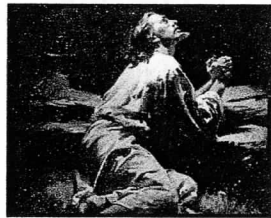
And he said, Abba, Father, all things are possible unto thee; take away this cup from me: nevertheless not what I will, but what thou wilt. Mark 14:36

And when the hour was come, he sat down, and the twelve apostles with him. And he said unto them, With desire I have desired to eat this passover with you before I suffer: Luke 22:14-15