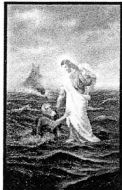
And he said, Come. And when Peter was come down out of the ship, he walked on the water, to go to Jesus. Matt 14:29